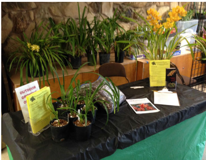
Our Education booth at the shepherd garden and arts center spring sale.