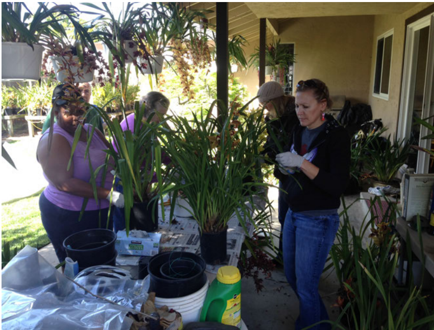
Members getting plants ready for the show & sale.