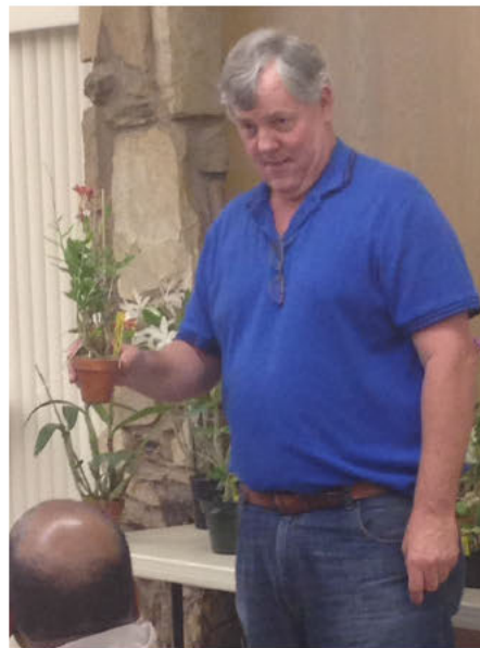
Not a weed.

For those who were not able to attend, we missed you, and hope you will be able to join us at our next meeting, or some time soon.