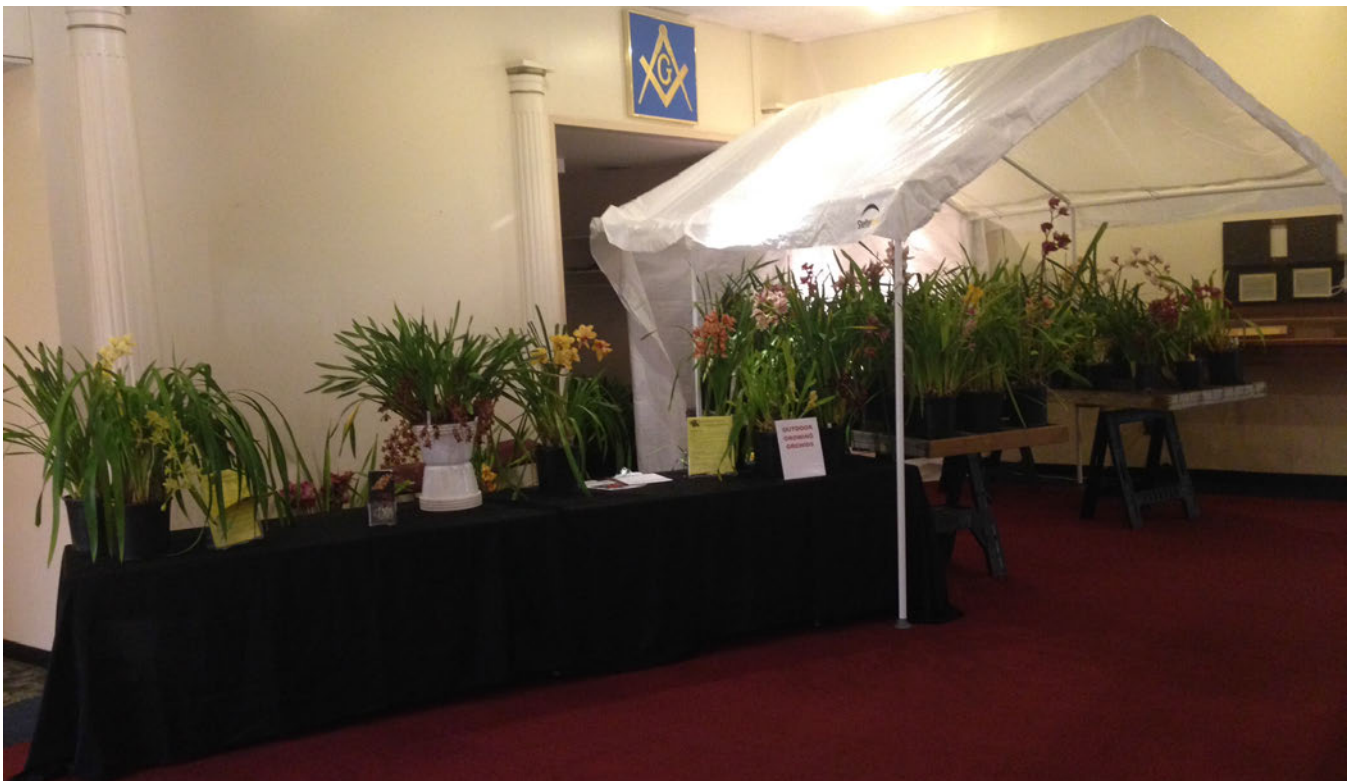
Our education booth at the SOS show and sale.